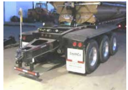
Pintle Hitch Stinger