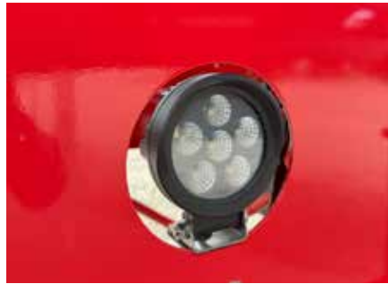
Work Light - In Frame