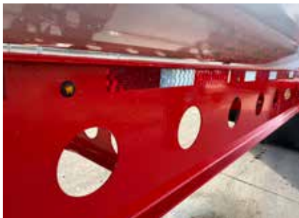
Bullet ID Lights