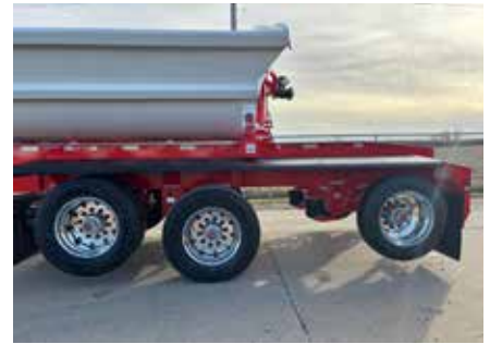
1st and 3rd Axle Lift