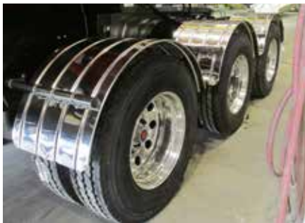
Half Moon Fender, Stainless