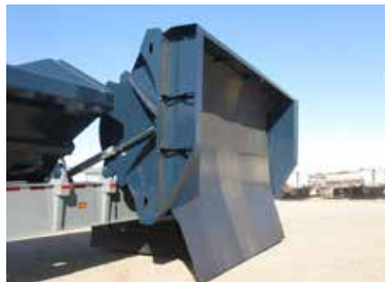
| Hinged Liner