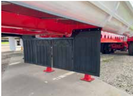
Mudflaps at Landing Gear, Full Width