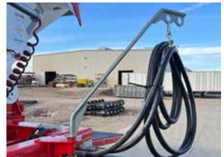
| Swivel Pogo Stick