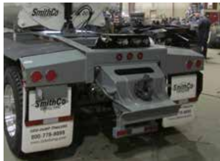
Pintle Hitch Combo Block