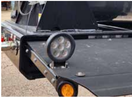
Work Light - Front