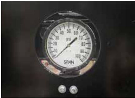
| Large Air Gauge in Frame