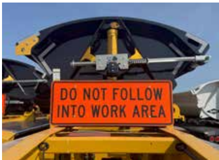
| Do Not Follow Signage