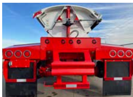
Additional Rear ID Lights (Standard: 3)