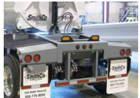
Mounted Strobe Lights