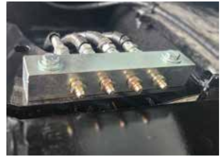
| 5th Wheel Remote Grease Assembly