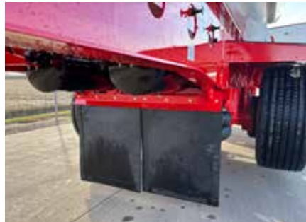
Mudflaps at Suspension