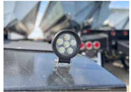
Work Light - Rear