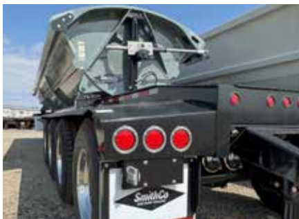
Additional Tail Lights (Standard: 2)