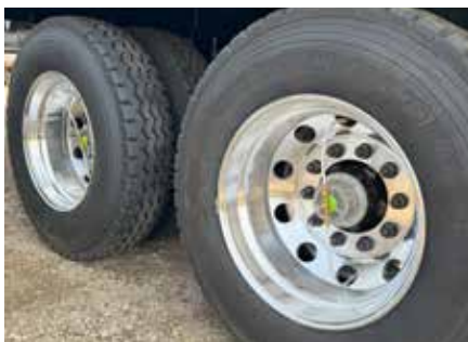
Tire Inflation System