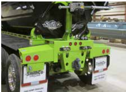
Pintle Hitch Block