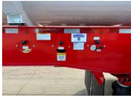
| Suspension Dump Valves