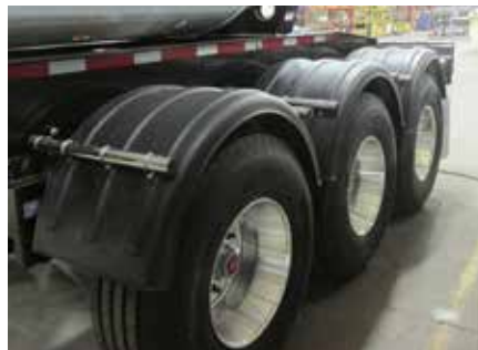
Half Moon Fender, Plastic