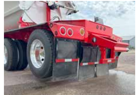
Mudflaps at Rear, Full Width