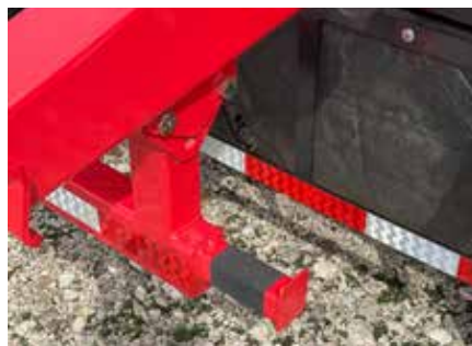
| Step Under Ride