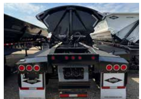
Rear Combination 5 ID Lights, 3 Tail Lights